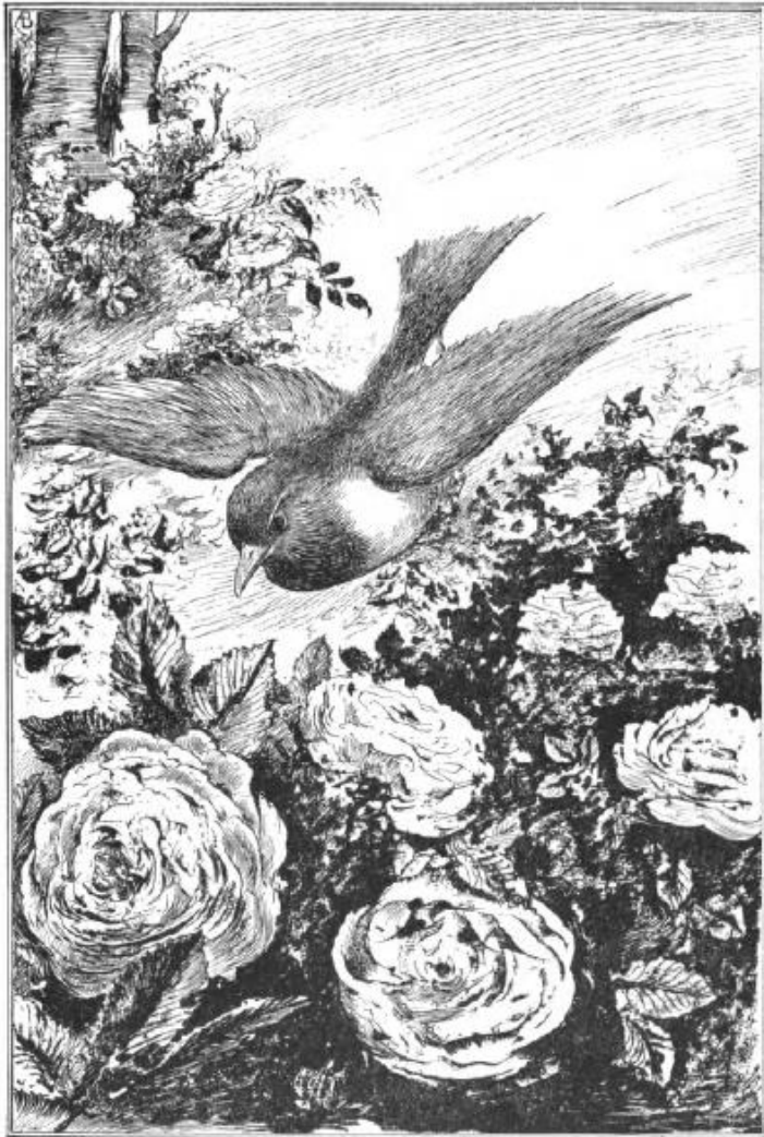
A HEAVENLY RUSH OF WINGS

most when I told him that it was impossible to say anything which could flatter him. It gave him confidence in my good taste.