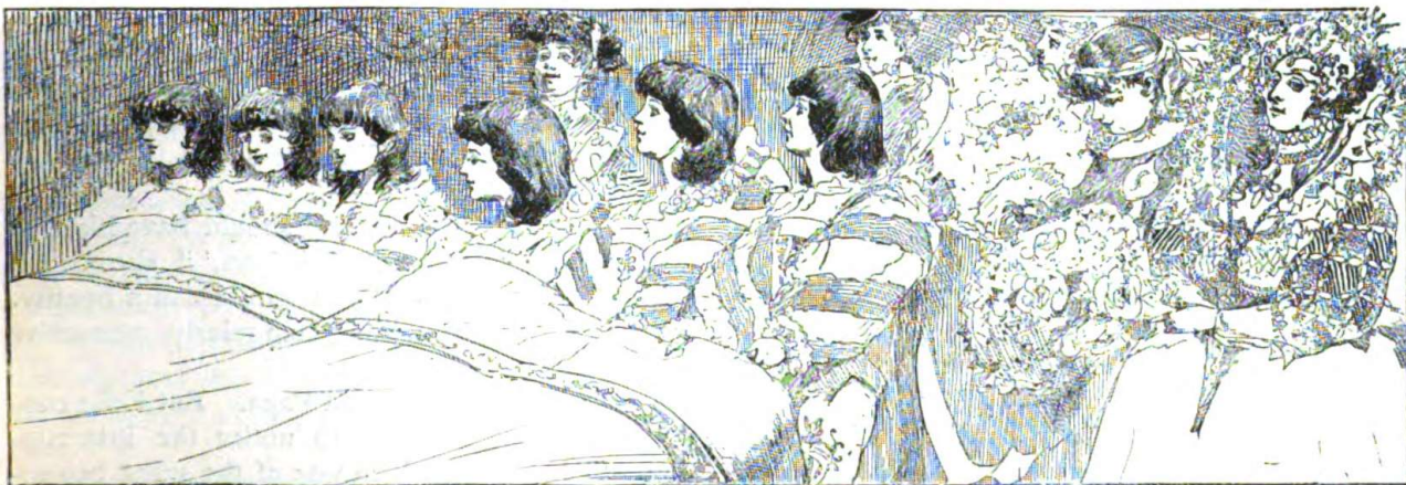
OF PRINCE FAIRYFOOT AND PRINCESS GOLDENHAIR.