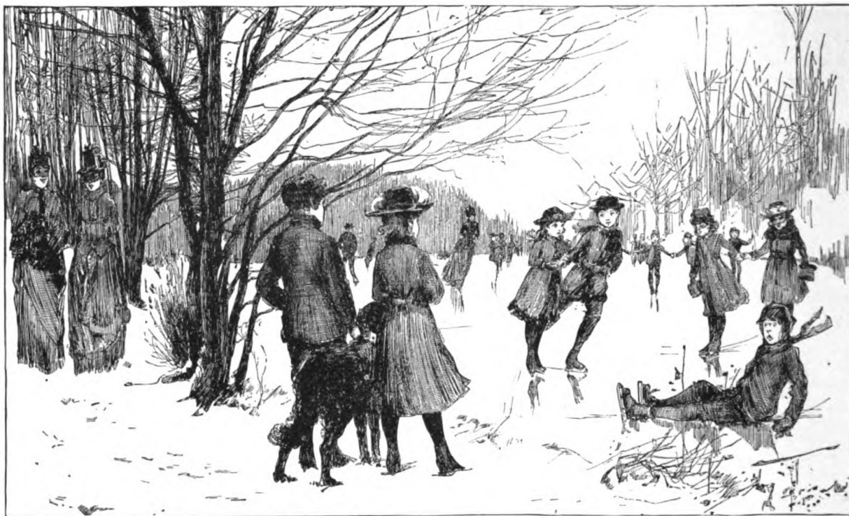
A GOOD DAY FOR SKATING.