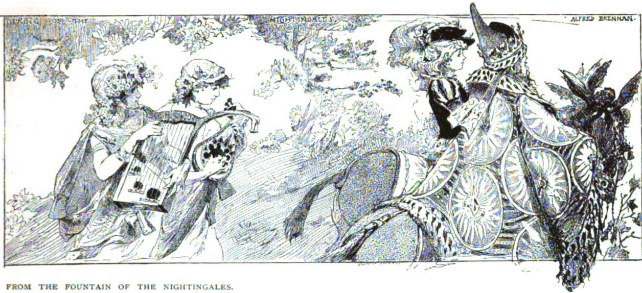
FROM THE FOUNTAIN OF THE NIGHTINGALES.

nothing more. But first he wished to visit his father and mother and sisters and brothers in Stumpinghame; so the King and Princess and their attendants went with him to the pool where the red berries grew; and after he had bathed his feet in the water, they were so large that Stumpinghame contained nothing like them, even the King's and Queen's seeming small in comparison. And when, a few days later, he arrived at the Stumpinghame Palace, attended in great state by the magnificent retinue with which the father of the Princess Goldenhair had provided him, he was received with unbounded rapture by his parents. The King and Queen felt that to have a son with feet of such a size was something to be proud of, indeed. They could not admire him sufficiently, although the whole country was illuminated and feasting continued throughout his visit.