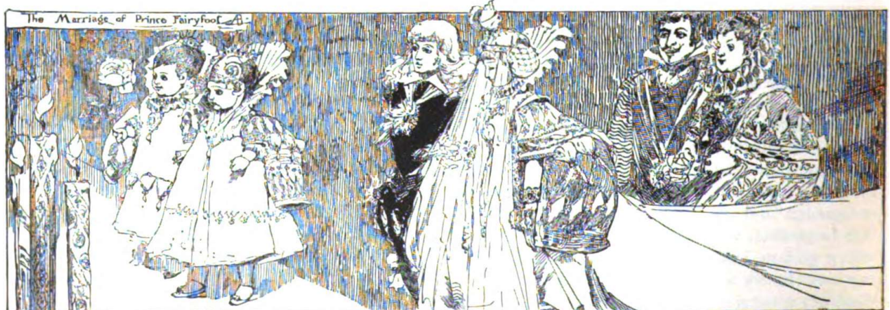
The Marriage of Prince Fairyfoot

She was so sweet and gentle that Fairyfoot could not bear the thought of leaving her; and when the King begged him to return to the palace with them and live there always, he was more glad than I can tell you. To be near this lovely Princess, to be her friend, to love and serve her and look at her every day was such happiness that he wanted