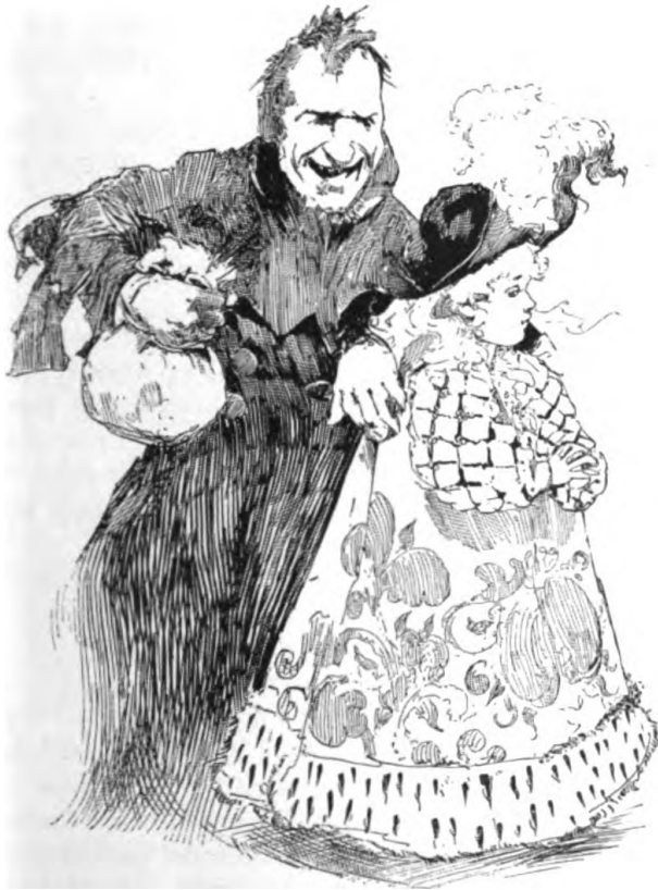
THE SWINEHERD IS WELL PLEASED TO RECEIVE THE LITTLE PRINCE AND THE MONEY.

One day he was resting under a great green tree, feeling really quite happy because everything was so beautiful. He had even made a little song to chime in with the brook's, and he was singing it softly and sweetly, when suddenly, as he lifted his curly, golden head to look about him, he saw that all his swine were gone. He sprang to his feet, feeling very much frightened, and he whistled and called, but he heard nothing. He could not imagine how they all could have disappeared so quietly, without making any sound; but not one of them was anywhere to be seen. Then his poor little heart began to beat fast with trouble and anxiety. He ran here and there; he looked through the bushes and under the trees;