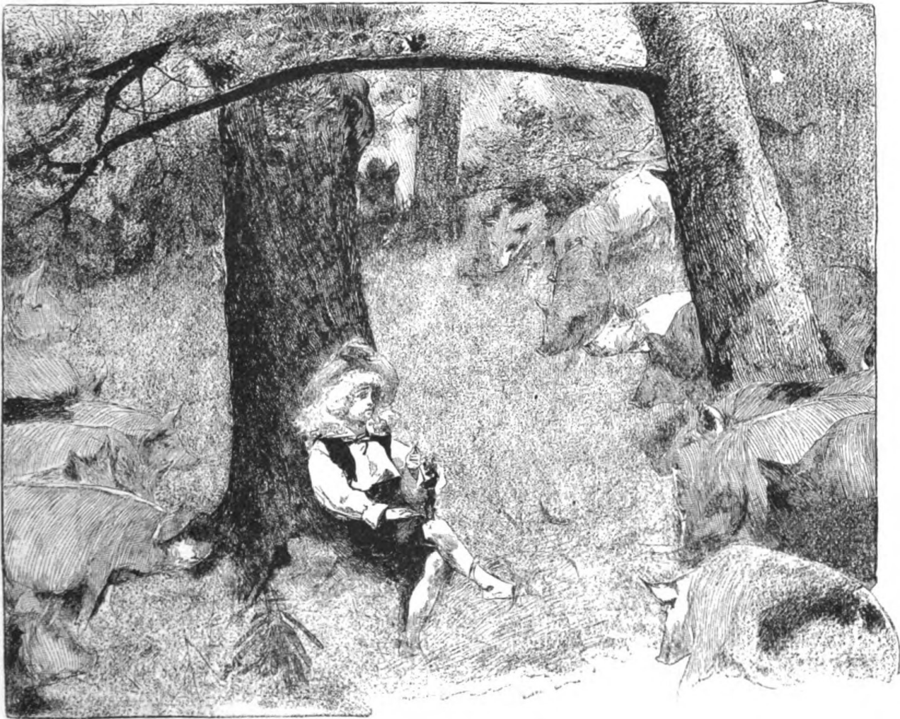
"THE NEXT INSTANT THE DROVE OF SWINE CAME TEARING THROUGH THE BUSHES." (SEE NEXT PAGE.)

"Do?" he said. "I got mad, of course, and told her that if she had n't interfered, it would n't have happened; said it was exactly like a hen to fly